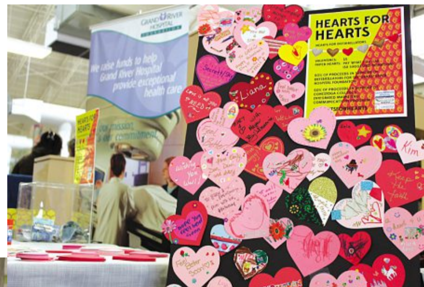
The paper hearts decorated by Kitchener Market visitors will be displayed at Grand River Hospital, as a symbol of hope and encouragement. Visitors decorated paper hearts, and donated over $650 to support Grand River Hospital's fundraising goal of 6 new defibrillators. Proceeds will also go toward any future events held by the students.