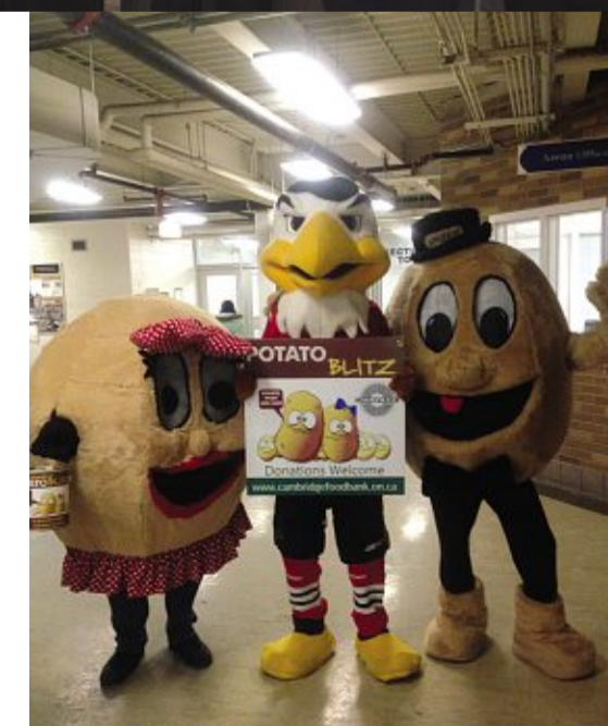
Spuddy and Sweet Potato working hard alongside the Winter Hawk's mascot Screech, to raise spud donations for the Cambridge Self-Help Food Bank's Potato Blitz drive at the game on Valentine's Day.

Look for the next Erb and Erb "Helping Hands" feature March 28, 2015! Deadline for photo submissions is March 25, 2015!