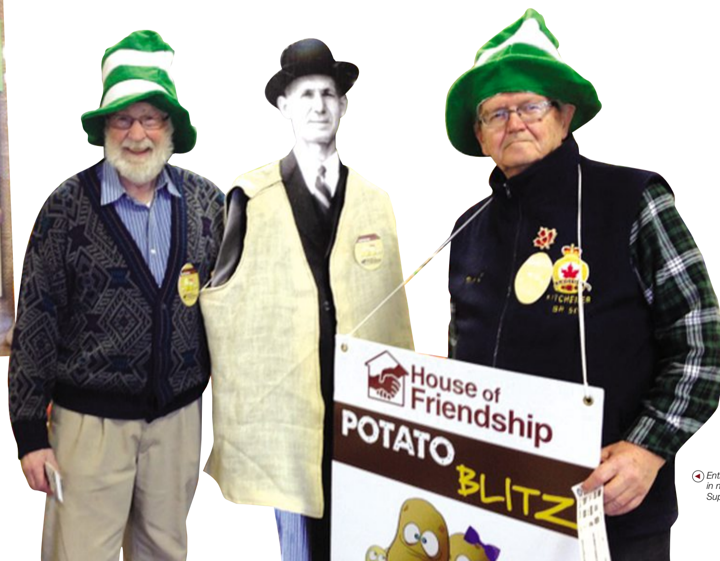
Enthusiastic volunteers serving neighbors in need during House of Friendship's Super Market Blitz.